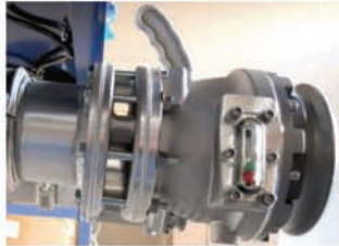
5200-SFI shown mounted on petroleum tank