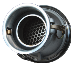
Inside View DB1000