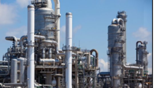
APPLICATION: For in-plant or tank truck use to transfer chemicals and solvents.