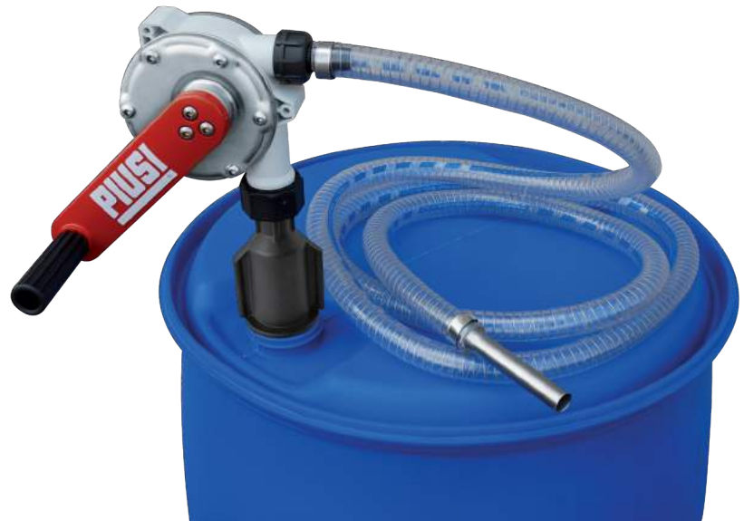
PIUSI HAND PUMP