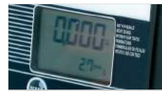
5 DIGITS PARTIAL TOTAL