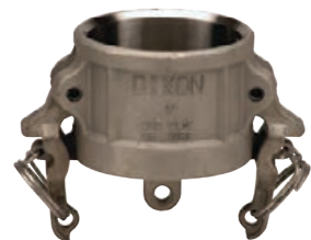
316 stainless steel