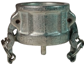
plated malleable iron