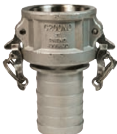
316 stainless steel