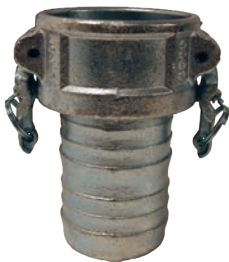
plated malleable iron