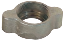
Plated iron / steel