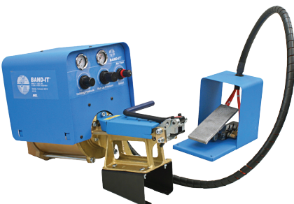
S75099 Pneumatic Junior ® Clamp Application Tool