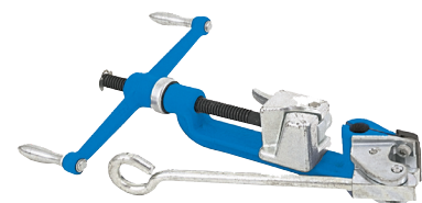
C00269 Junior ® Preformed Clamp Tool

BAND-IT ® Junior ® Smooth ID Preformed Clamps