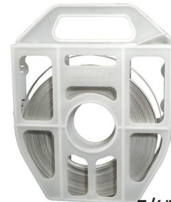
3/4" Ultra-Lok® Tote