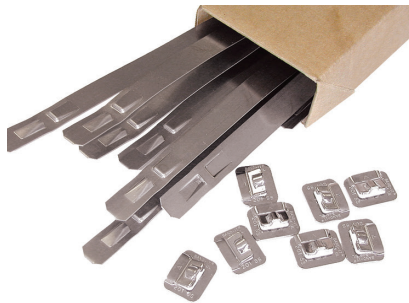
1/2" Ultra-Lok® Free End Band with Buckle