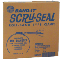
Scru-Seal Kit with VALU-STRAP™ M21099