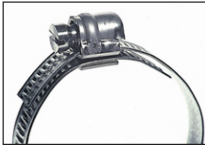
Scru-Band Rack and Housing