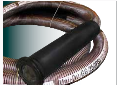
Hose is coiled and when placed on a pallet, is ready for shipment.