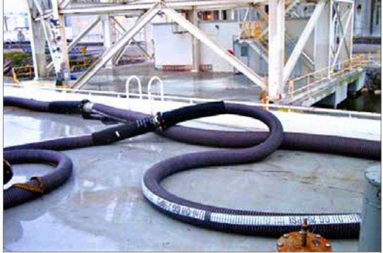
Hose in service: Note the gradual bend achieved off of the horizontal connections